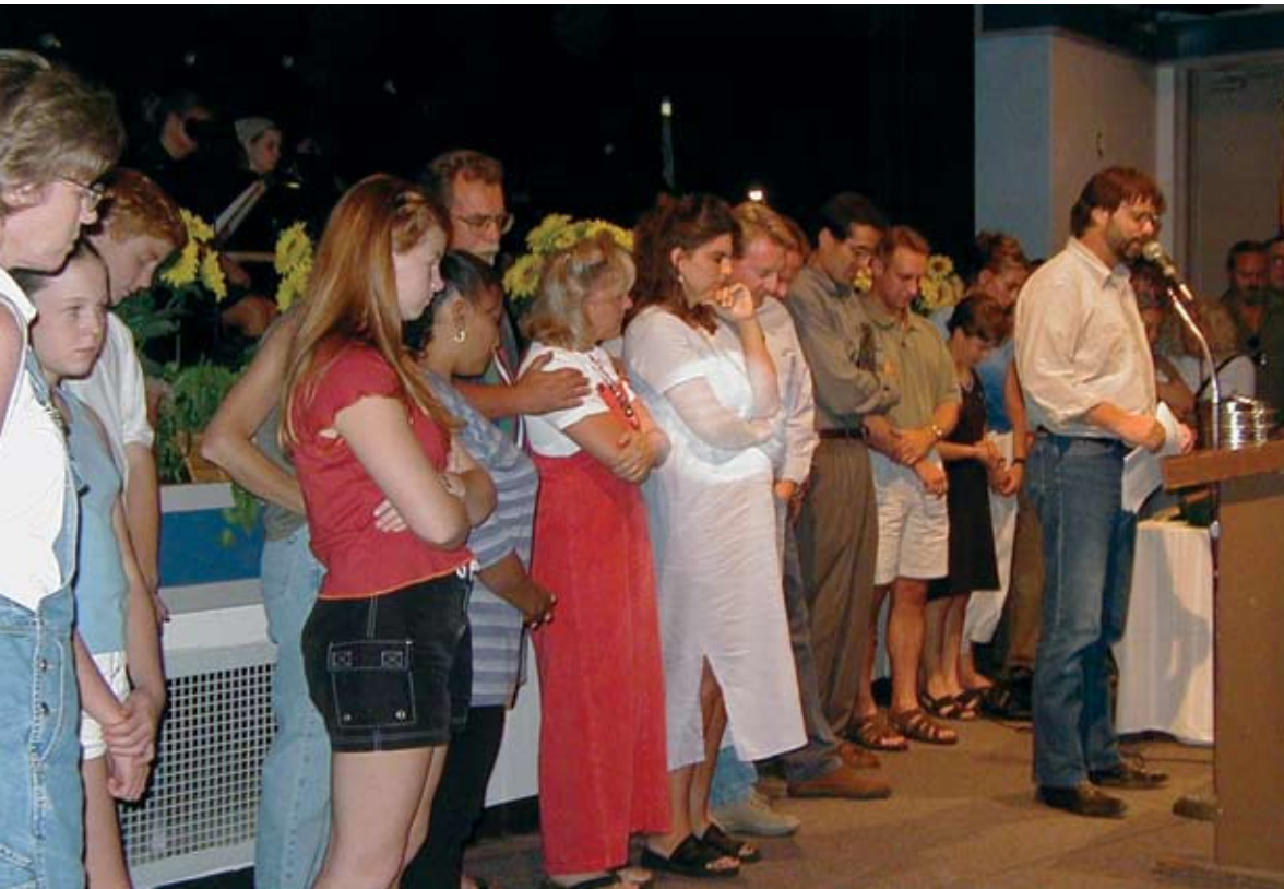
Leaving Open Door Fellowship