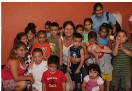
Moms' Place graduates giving back to the community, serving as teachers this summer at Kids' Club