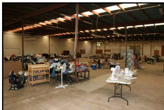
Below: The Micro-Enterprise building was used for the Parent Store in April.