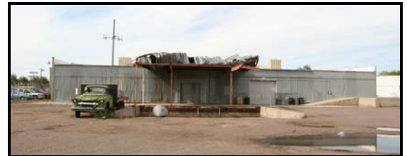
Above: The Micro-Enterprise building as it looks today. Below: Artist's rendering of renovated building.

One of the main purposes of the thrift store is to provide a way for parent volunteers to use their "parent bucks" year round instead of waiting for the parent stores, which happen once every four months. For many parents, their volunteer hours and earned "parent bucks" are a key source of income for the family. One parent spoke to