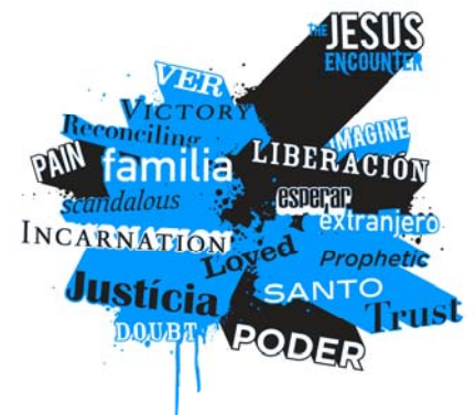
Above image is the back imprint of t-shirt. Front of t-shirt has NM logo over pocket.