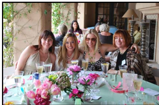
Above: Ladies enjoying their time at the Come For Lunch luncheon.